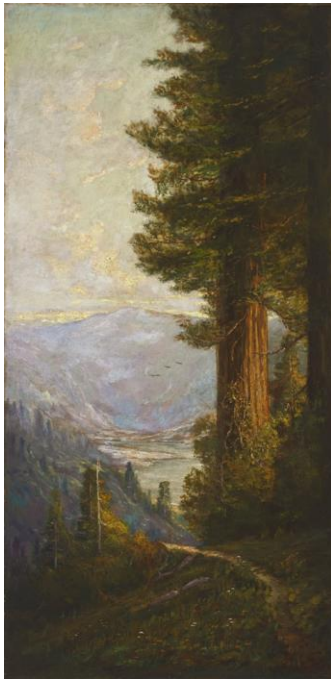
View of the Russian River from Guerneville Heights