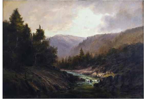
Big Sulphur Creek, 1908 36 x 52 Collection of Geoff and Lien Wolfe