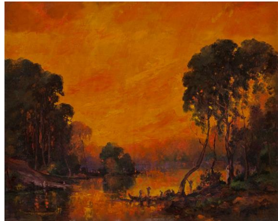
Red Sky at Sunset, ca 1924