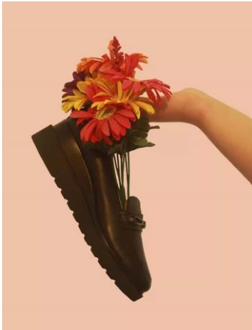
Yanell Velazquez, "Floral Footwear", 1 st Place, Alternative Process