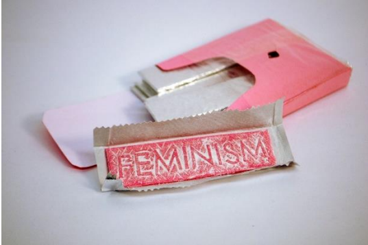
Alyssa Eustaquio, Keeping FEMINISM Fresh , 2013, Mint chewing gum, paper, plastic sleeve and Wrigley's foil chewing gum wrappers, 3 x 2.5 x .5 inches

Images ( click here to view and download)