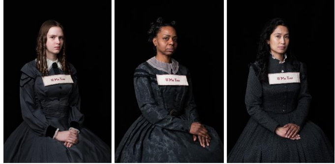
Vanessa Filley, #MeToo , 2018, Archival pigment print on cotton rag paper, 30 x 20 inches each