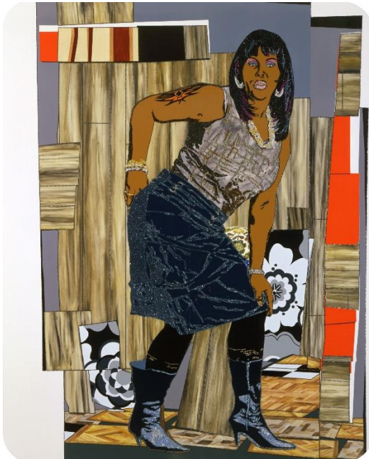
Mickalene Thomas, All She Wants to Do is Dance (Fran) , 2009, Rhinestones, acrylic on enamel wood panel, 120 x 95.75 inches