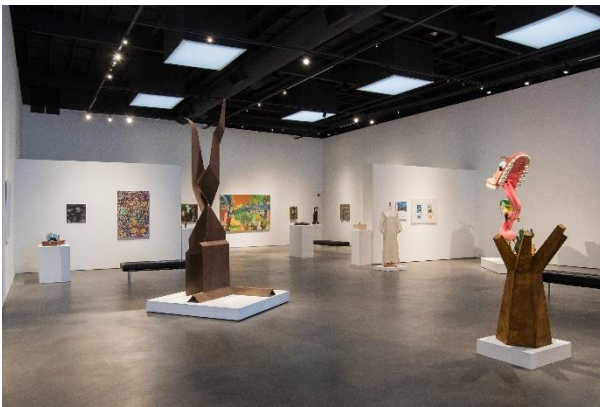
Installation image of "35: Thirty-Five Artists for Thirty-Five Years," currently on view at the Museum of Sonoma County.