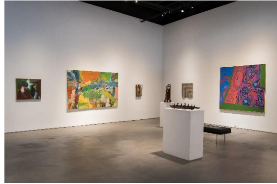
Installation image of "35: Thirty-Five Artists for Thirty-Five Years," currently on view at the Museum of Sonoma County.