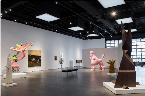
Installation image of "35: Thirty-Five Artists for Thirty-Five Years," currently on view at the Museum of Sonoma County.

Images ( click here to view and download)